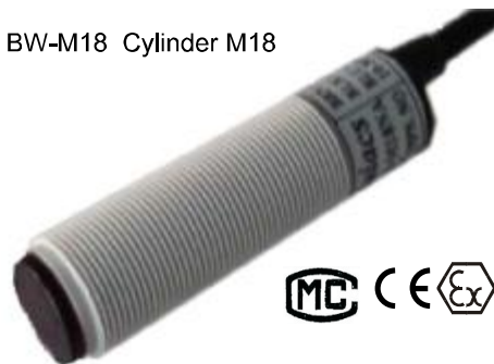
BW-M18 Cylinder M18